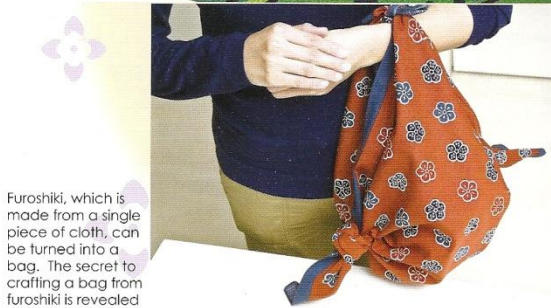
Furoshiki, which is made from a single piece of cloth, can be turned into a bag. The secret to crafting a bag from furoshiki is revealed on Page 16.