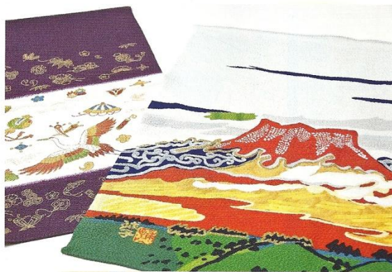
The furoshiki on the left is entitled "Takarazukushi," or full of treasures, as its traditional pattern describes eight treasures, while the other furoshiki features Japan's iconic Mt. Fuji.

Furoshiki — cloth used for wrapping that has long been a tradition in Japanese culture — has been attracting attention in recent years as a reusable product with little impact on the natural environment. In this issue, we focus on furoshiki and its use.