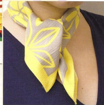
Many furoshiki in recent years have featured modern designs, which make them also suitable as scarves, among other things.