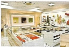
Tokyo Karakusaya of Furoshiki shop