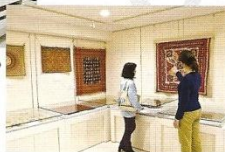
Tokyo Fuji Miyabi Furoshiki Gallery

You can find a variety of furoshiki at Tokyo Karakusaya, which cooperated in our report. There is a gallery on the fifth floor of the same building (which is open by reservation only). A collection of antique furoshiki, written information and other materials are on display, and the gallery offers classes on folding furoshiki.